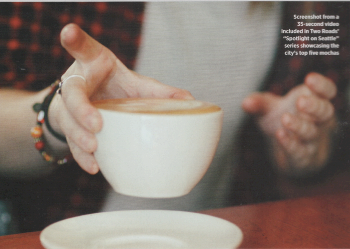
Screenshot from a 35-second video included in Two Roads' "Spotlight on Seattle" series showcasing the city's top five mochas