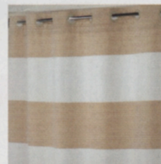
Sonoma By Focus Products