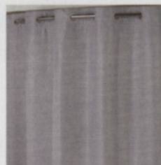
Hudson By Focus Products

guestsupply.com ©2017 Guest Supply®, a Sysco® Company