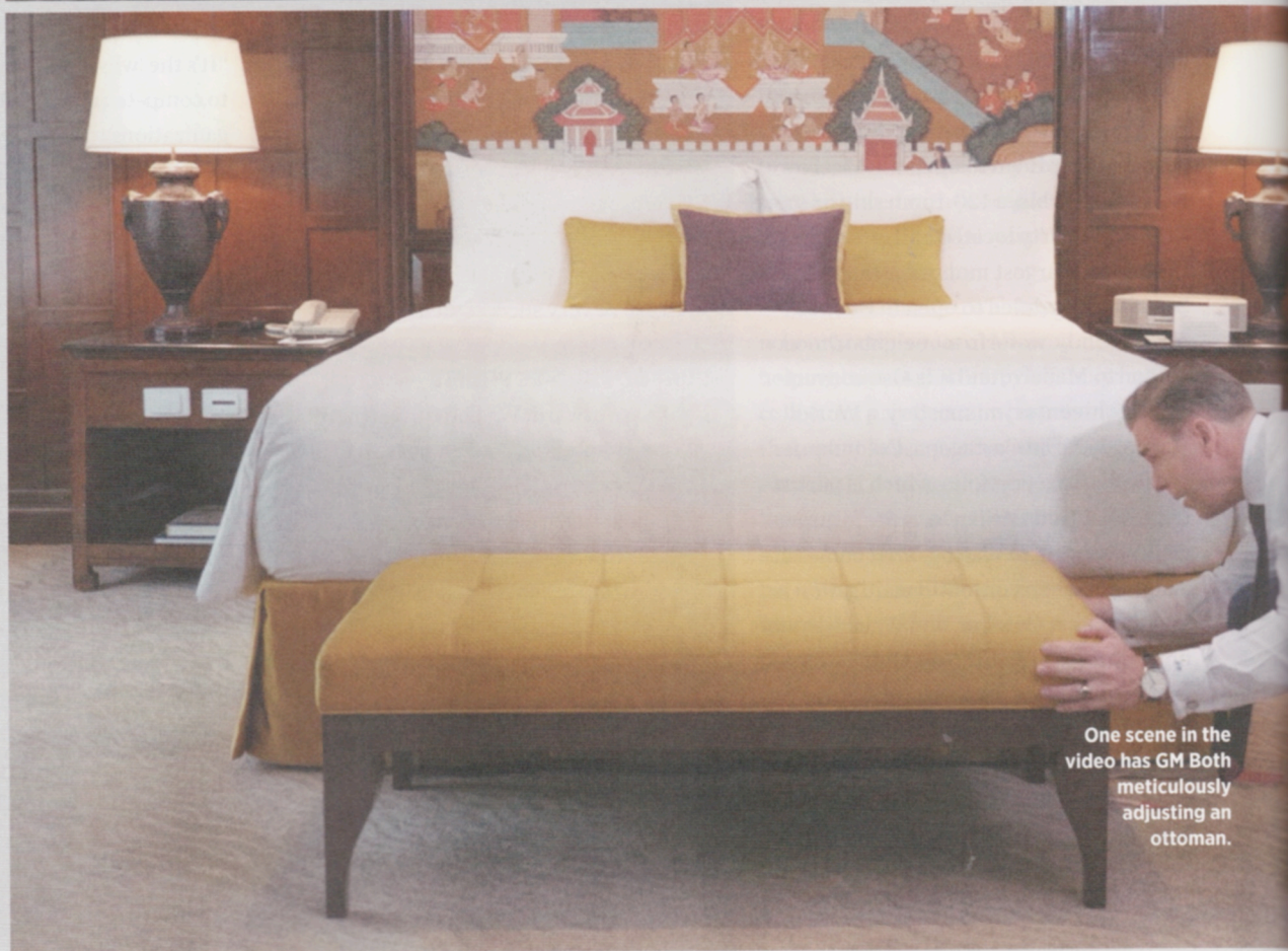
One scene in the video has GM Both meticulously adjusting an ottoman.