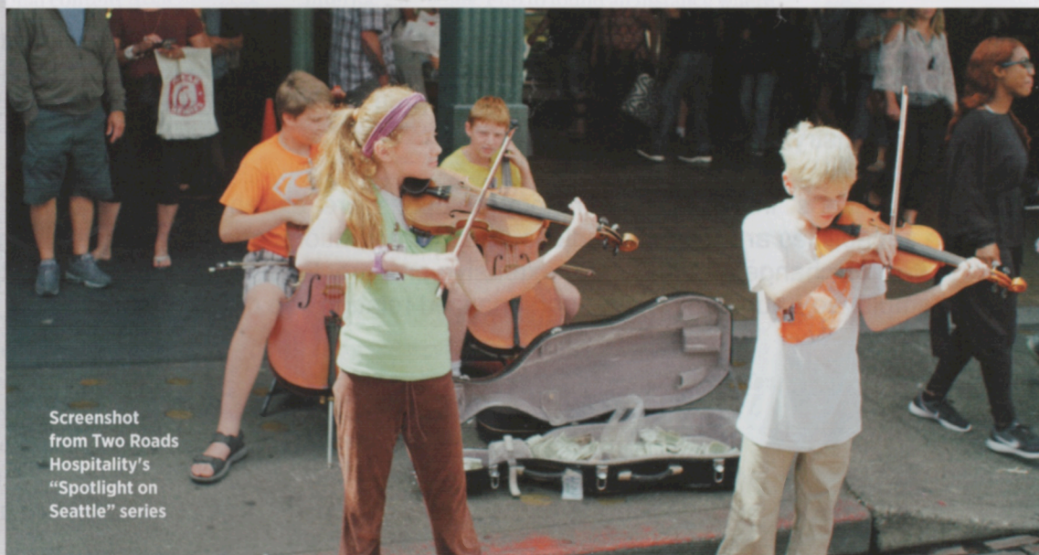
Screenshot from Two Roads Hospitality’s “Spotlight on Seattle” series

“Key messages should be simple and they should be articulated them with strong visuals,” she adds.