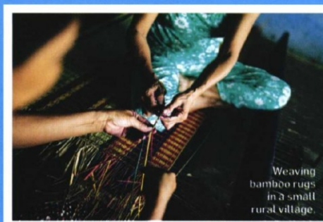
Weaving bamboo rugs in a small rural village.

The town is famous for Chinese-style lanterns, which family-run Hoi An Handmade ( hoianhandmade.com ) has been crafting for generations. At Meo Meo Atelier ( meomeoembroidery.com ), owner Pham Thi Ngoc Tram merges colors, designs and textures into embroidery masterpieces. Browse modern lighting and furniture at Mosaic Decoration ( mosaique-decoration.com ), and cross the bridge to Randy's Book Xchange ( bookshoian.com ) on Cam Nam Island to pore over used volumes.