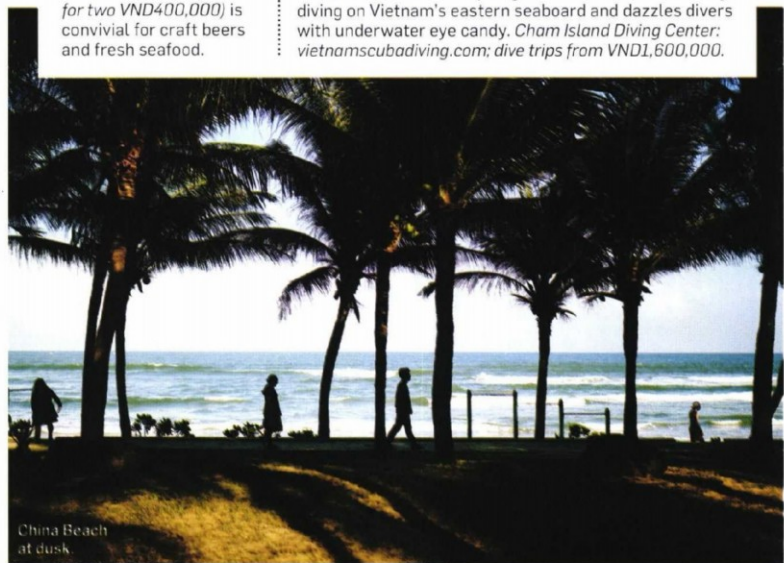
China Beach at dusk

The Cu Lao Cham archipelago offers the most northerly diving on Vietnam's eastern seaboard and dazzles divers with underwater eye candy. Cham Island Diving Center ; vietnamscubadiving.com ; dive trips from VND1,600,000.