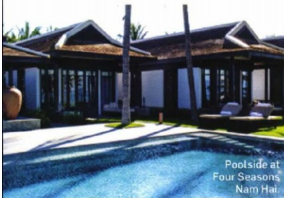
Poolside at Four Seasons Nam Hai.