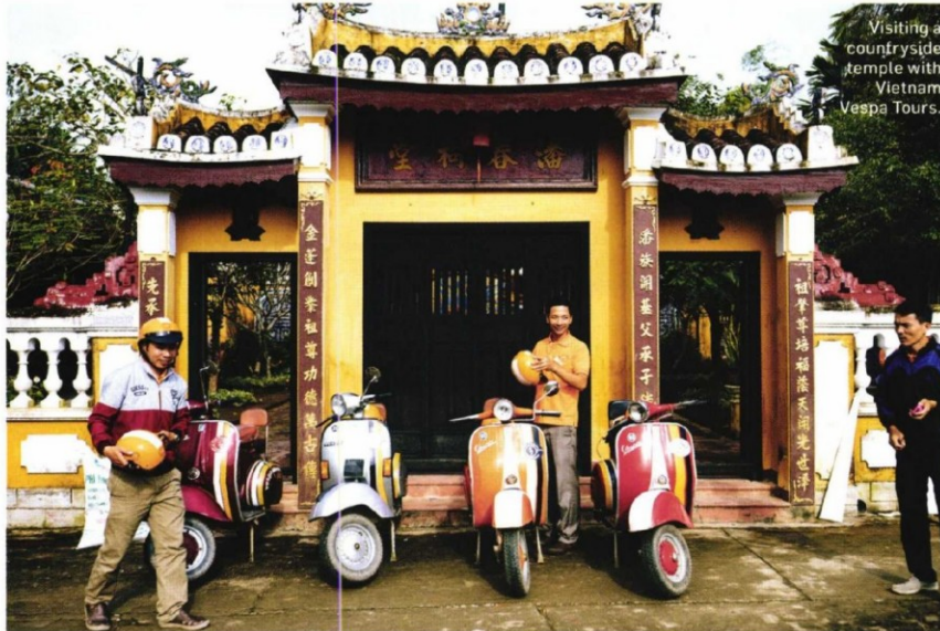
Visiting a countryside temple with Vietnam Vespa Tours.