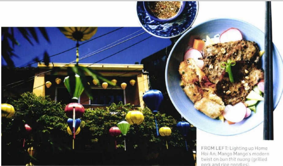
FROM LEFT: Lighting up Home Hoi An; Mango Mango's modern twist on bun thit nuong (grilled pork and rice noodles).