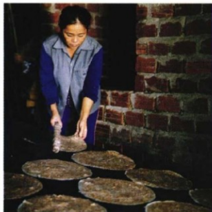
Making rice pancakes in a nearby village.