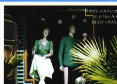
Haute couture in a Hoi An tailor shop.

Hoi An has become a hotspot for having a suit made or a dress copied—"you need a tailor?" will become a familiar refrain during a visit. The ancient buildings are brimming with cute boutiques and upscale souvenirs.