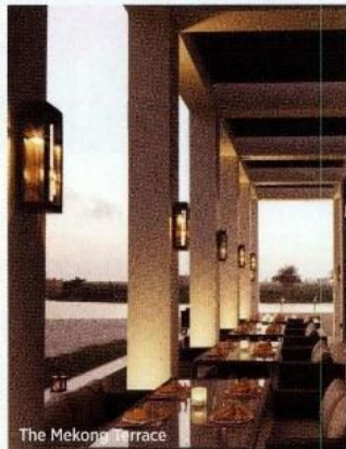
The Mekong Terrace

Paying tribute to traditional Omani custom, the main part of the hotel is the tallest building to be seen for miles and the only one to emerge from the canopy. The rest of the resort, including all 96 private villas, the recreation centre, the spa and the library is all below tree level – it is a nod to days gone by when only the chieftain's house could be seen from the sea. It is thoughtful details such as this that lend Al Baleed its own, warm and welcoming, identity, rather than allowing it to become yet another luxury hotel with a view. Nevertheless, those travelling from the GCC and accustomed to its standards of hospitality will find the hotel reassuringly familiar – all of the amenities that are associated with this part of the world are present and accounted for, from wonderfully welcoming staff to sumptuous accommodation and a fleet of white tuk tuks to make sure that guests never have to walk too far. But don't expect some sprawling resort with a different dining option for every night of the week – the hotel is intimate, with just three signature restaurants, yet it strikes just the right balance between a 5* resort and a relaxed coastal hideaway. It is definitely big enough for an