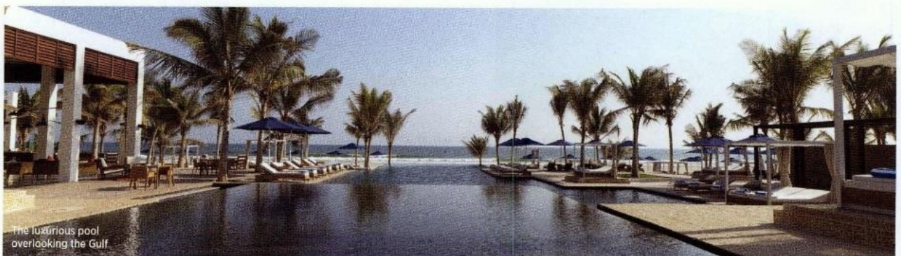
The luxurious pool overlooking the Gulf

Premier Sea View Room from Dhs1,450 per night