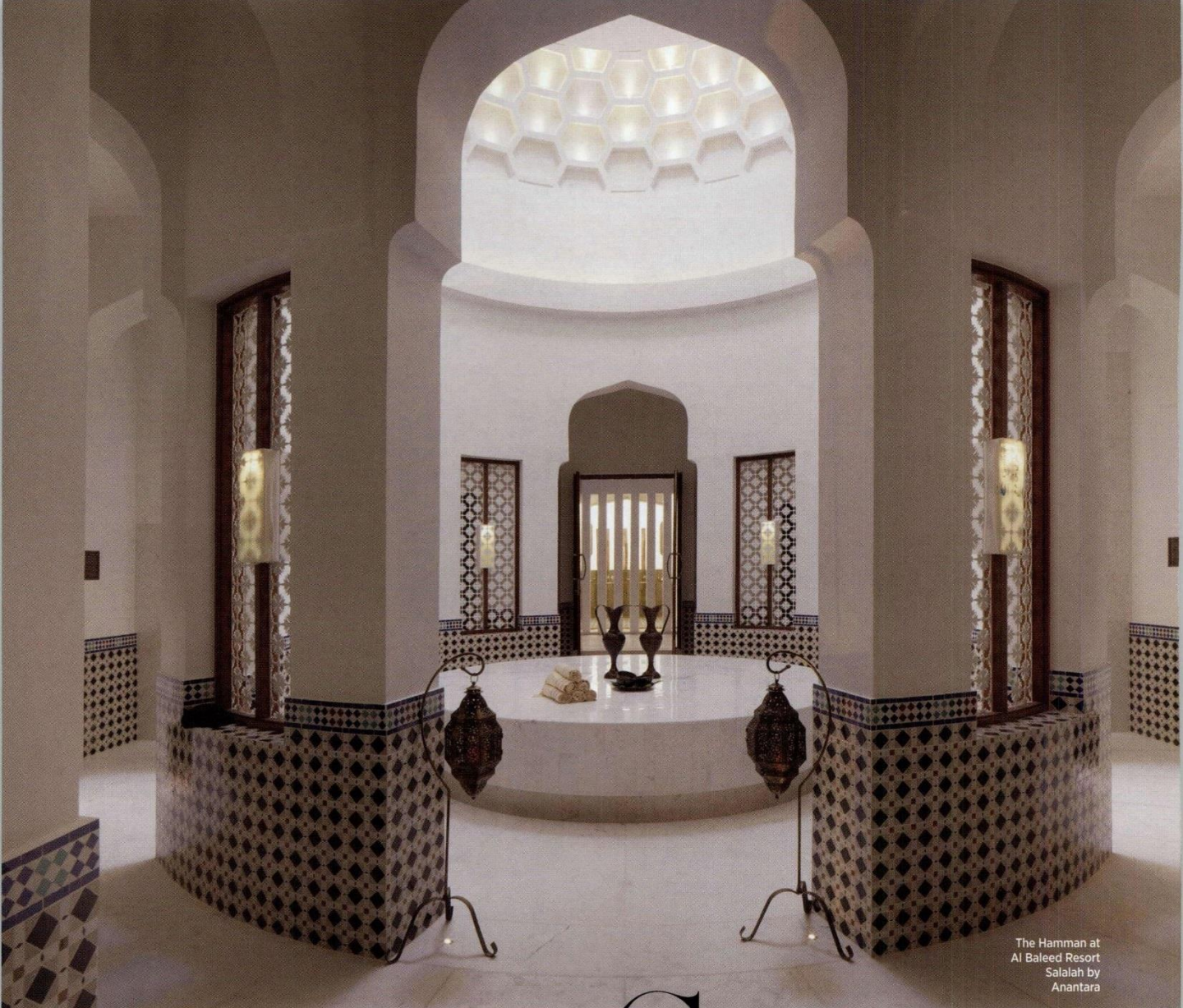
The Hamman at Al Baleed Resort Salalah by Anantara