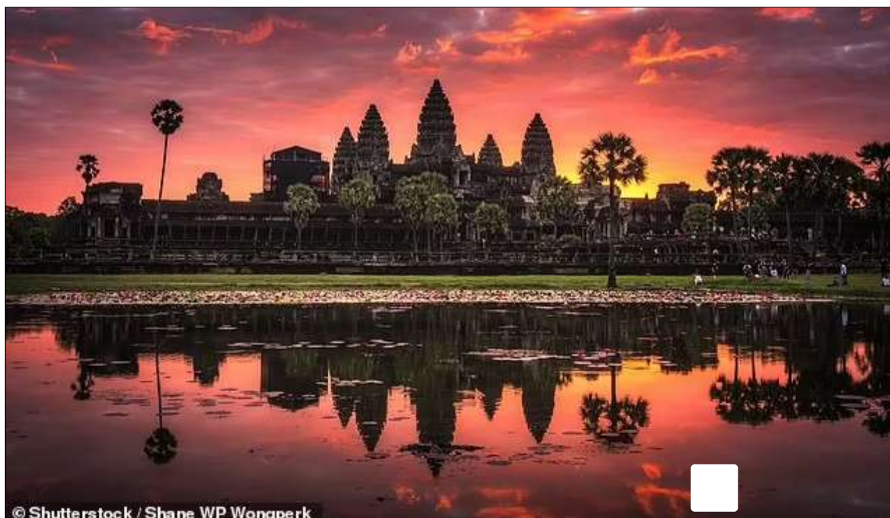
The 'shock of the 3am alarm call' is worth it for sunrise views like the above over Angkor Wat

▶ Pamela Salem dead at 80: James Bond's Miss Moneypenny and EastEnders star passes away after decades-long career in showbusiness