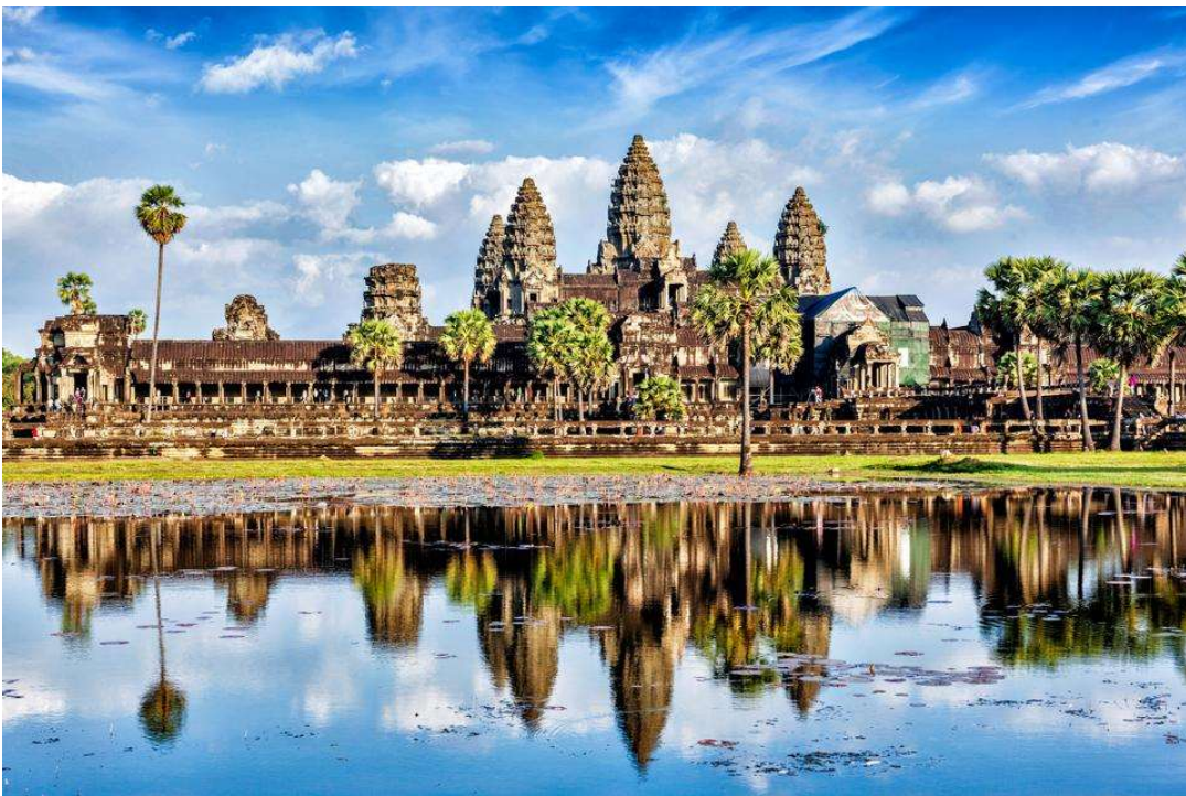
The main event at the Angkor Archaeological Park is the Angkor Wat temple complex, reflected in the... [+]

For the past two years I've long been predicting a surge in Bucket List travel, because the pandemic helped people realize that life is short and unpredictable, and the things you put off may never come around - plus, who knows what the next shoe to drop might be? Travel is getting easier again as things reopen from pandemic closures, so if Angkor Wat is one of those places you planned to see "someday" - and it should be - you might just want to make someday now.