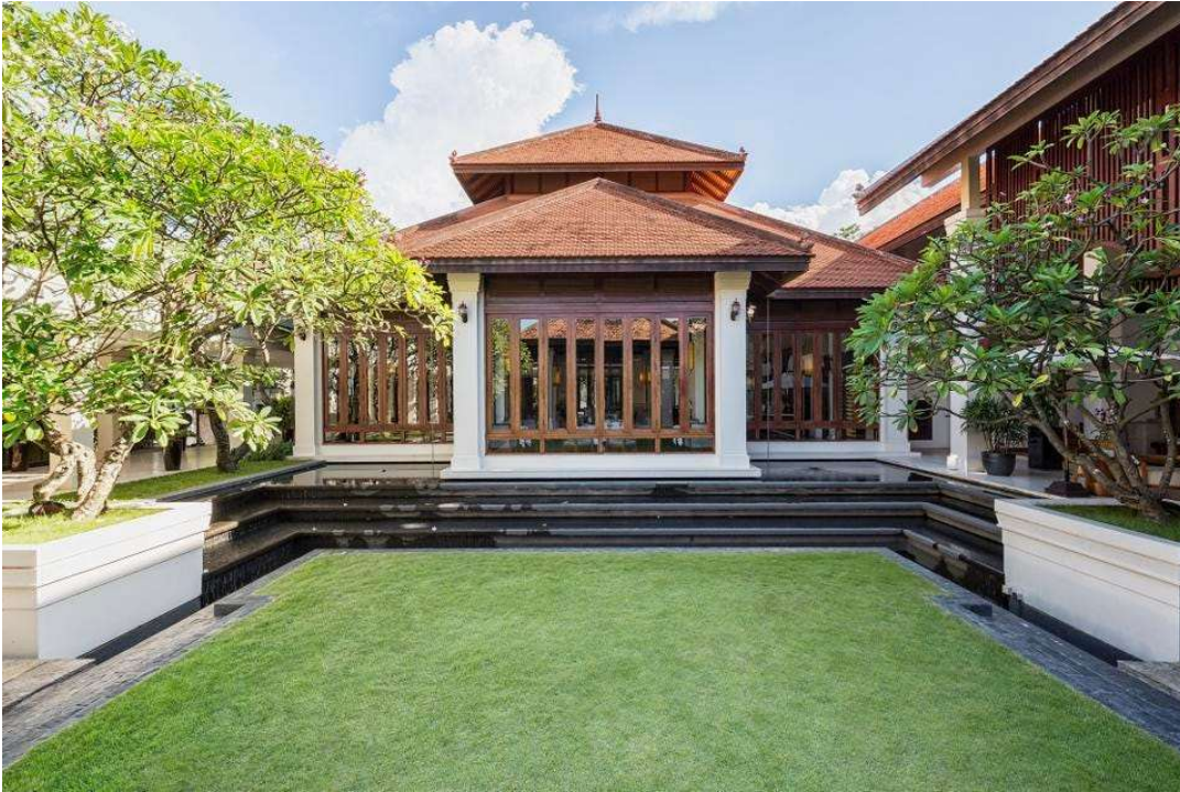
The main restaurant at the Anantara resort, with courtyard dining as well. RÉGIS BINARD

cooking classes focused on Khmer Cambodian cuisine, and four dining options.