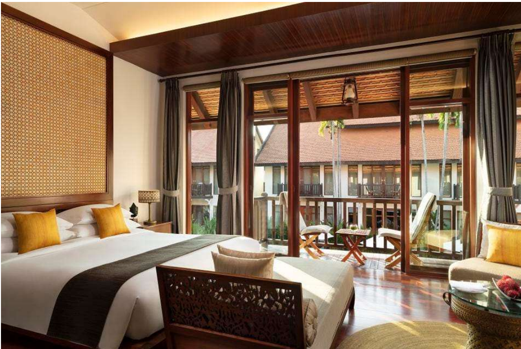
A basic guest room at the luxurious Anantara Angkor Wat resort.

So what's new? When I visited, I stayed at the Anantara Angkor Wat and I loved it. I chose it because Anantara is one of those hidden gem foreign luxury brands off the radar of many American tourists, but not for long. Owned by an ex-pat American pizza mogul, the Thai based luxury chain has been growing by leaps and bounds and just expanded into Europe with a luxury golf resort in Portugal and top tier city hotels in Rome, Dublin and Budapest. They also own NH Hotels , including the new NH New York, and some of the more famous Anantara properties are the Royal Livingstone at Victoria Falls, The Palm in Dubai, and Natadhu