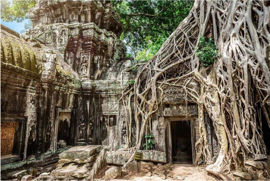
Ta Prohm, the jungle temple, was made famous as a film setting in the Angelina Jolie hit Tomb ... [+] GETTY

The region is widely misunderstood by tourists who expect it to be a one hit wonder hit like Machu Picchu or Giza, going for a day, take some selfies. The gateway to Angkor Wat is the modern city of Siem Reap, also fascinating and much bigger than you might expect with tons of hotels, shopping, dining, other worthwhile touristic sights such as floating villages, a silk farm, cultural centers and even a pretty good golf course. Between the two, you are talking about a region, not an “attraction” or monument, and it can be part of a larger trip to Cambodia and/or Thailand or a great vacation destination in its own right. Even though there are luxury hotels here, Cambodia is an inexpensive place, and park admission, guides and food are all great values.