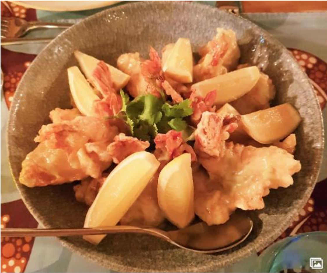
Tempura prawns.

We started with a duck salad with sun-kissed tomato, cucumber and tom yam dressing; tempura prawns with pickled cucumber and wasabi dressing and Tuna tartare served with avocado and fresh herbs to start.