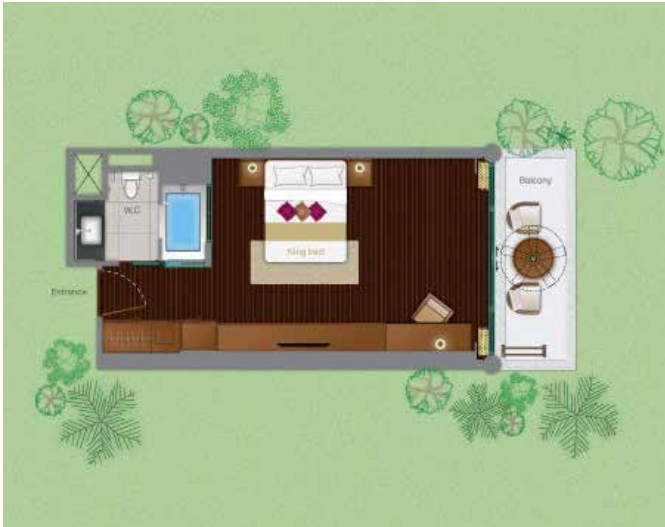
Junior Lagoon View Suite