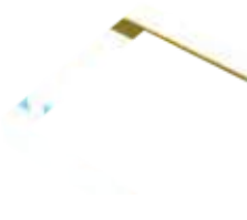
4 Ruen Nok