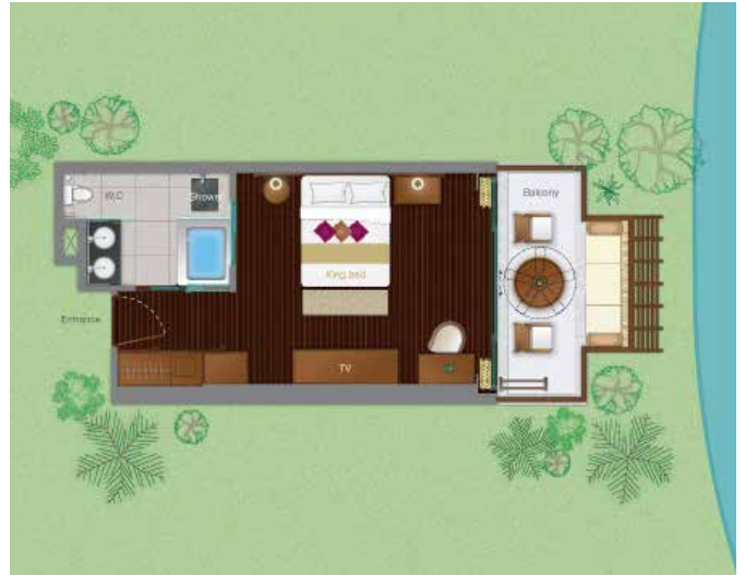
Deluxe Garden View