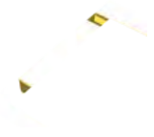
2 Ruen Thai