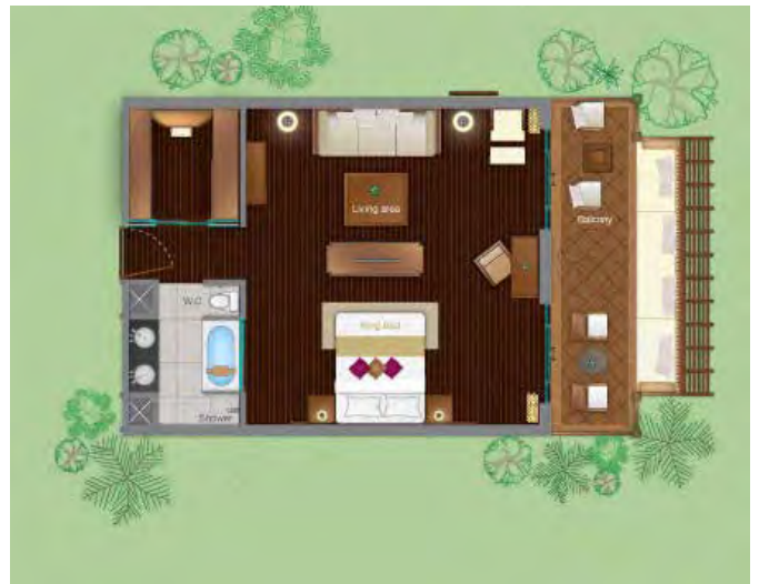
Premium Sea View