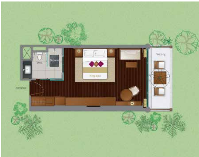
Anantara Garden View Suite