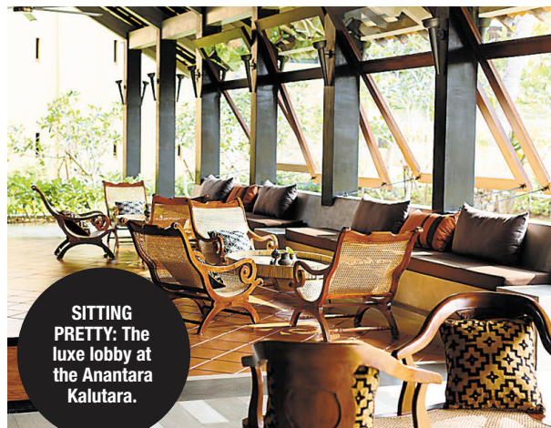
SITTING PRETTY: The luxe lobby at the Anantara Kalutara.

Here's a taste of the island's best design spots.