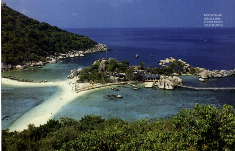
Koh Samui will deliver a slew of Insta-worthy snaps. #nofilter