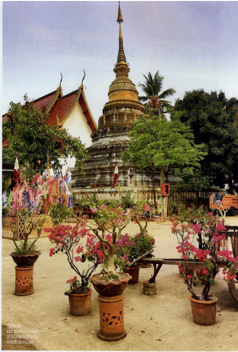
The city's spiritual heart of Chiang Mai is more than just a temple.

• dusitD2 (+66 53 999 999) One of Chiang Mai's first chic, contemporary establishments for travellers, this 131-room boutique hotel is surrounded by the city's bustling night bazaar and authentic Thai restaurants – perfect for any Grazia girl, right? For those looking to wind down even more, treat yourself at dusitD2's multi-award winning Devarana Spa, before dining at the hotel's cool yet casual Moxie restaurant. 1