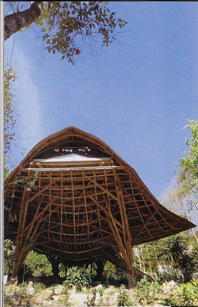
The Den at Soneva Kiri (left and below) is the ultimate kids' club

villas, round-the-clock butler service for all accommodation types and unlimited access to the chocolate room, which is exactly as it sounds: a room full of chocolates that you can eat at will.