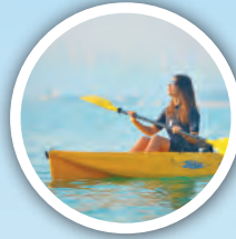
Single Kayak 30 Min 100 AED