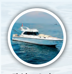
Fishing Cruise 4 Hours 4000 AED Up to 6 Persons