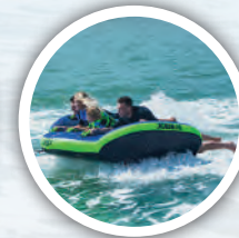
Airstream Ride 15 Min 200 AED