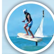
Jet Board - Foil 900 AED / 30 Min 1500 AED / 60 Min