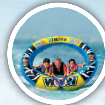
WOW Ride 15 Min 200 AED