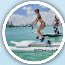
Schiller Bike 30 Min 250 AED