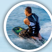
Knee Boarding 15 Min 400 AED