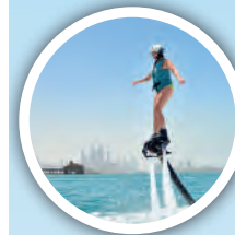
Flyboard 500 AED / 30 Min 900 AED / 45 Min pro