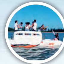
Electric Catamaran 600 AED / 15 Min 1000 AED / 30 Min