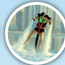
Jetpack 500 AED / 30 Min 900 AED / 45 Min pro