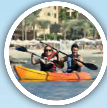
Double Kayak 30 Min 125 AED