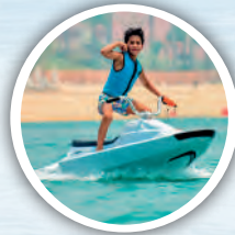
Electric Jet Ski 600 AED / 15 Min 1200 AED / 30 Min