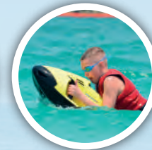
IAqua 15 Min 450 AED