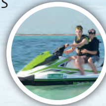
Jetski Tour Double 750 AED / 30 Min 1400 AED / 60 Min