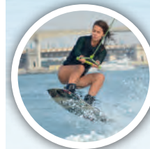
Wakeboard / Skiing 15 Min 400 AED