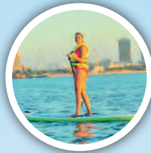
SUP 30 Min 100 AED