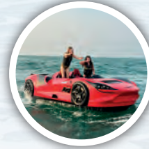
Jet Car 2500AED / 30 Min 4500AED / 60 Min