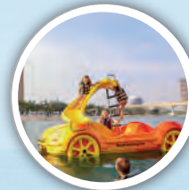
Pedal Boat 30 Min 300 AED