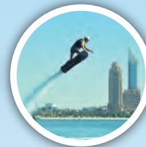
Hoverboard 500 AED / 30 Min 900 AED / 45 Min pro