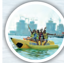
Banana Boat 15 Min / 2PX Min 200 AED