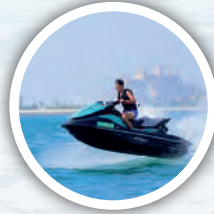
Jetski Tour Single 600 AED / 30 Min 1000 AED / 60 Min