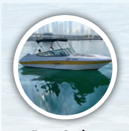
Boat Cruise 60 Min 1000 AED