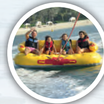
Donut Ride 15 Min / 2PX Min 200 AED