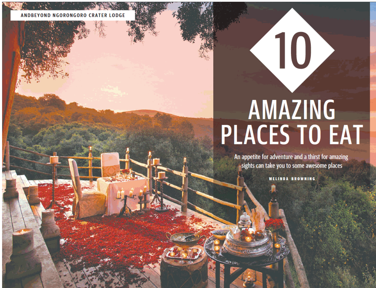
ANDBEYOND NGORONGORO CRATER LODGE