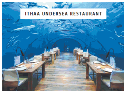
ITHAA UNDERSEA RESTAURANT