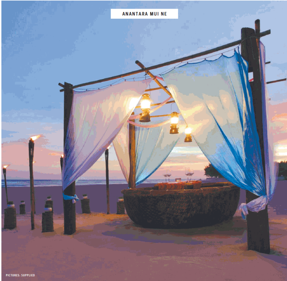
ANANTARA MUI NE