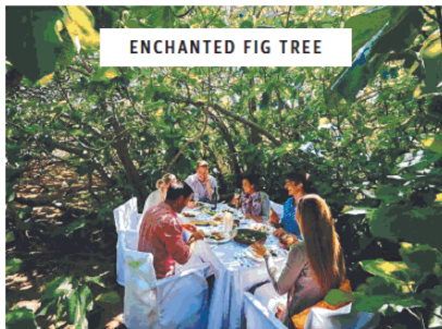
ENCHANTED FIG TREE