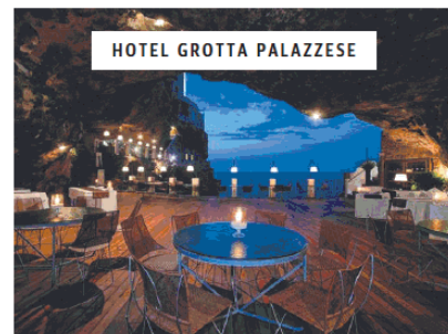
HOTEL GROTTA PALAZZESE

1 ITHAA UNDERSEA RESTAURANT, MALDIVES There's something a bit fishy about this restaurant – nothing to do with the chef. Dining doesn't come much more exotic than 5m below sea level, watching the reef life from the world's first glass undersea restaurant. The six-course set dinner menu aims to live up to the exquisite surrounds with dishes including caviar, lobster and spicy sea snails. Guests are advised to book well in advance at Ithaa Undersea Restaurant – but as one of 10 bars and restaurants at the Conrad Maldives Rangali Island resort, there are plenty of back-up options featuring impressive lagoon views. HILTONMALDIVESRESORT.COM