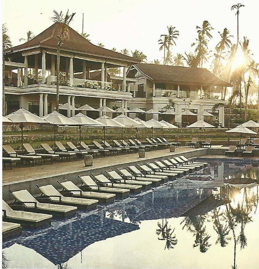
Peace Haven Tangalle's Sri Lankan-inspired architecture and crystalline pool (above); picking cashew fruit by the roadside