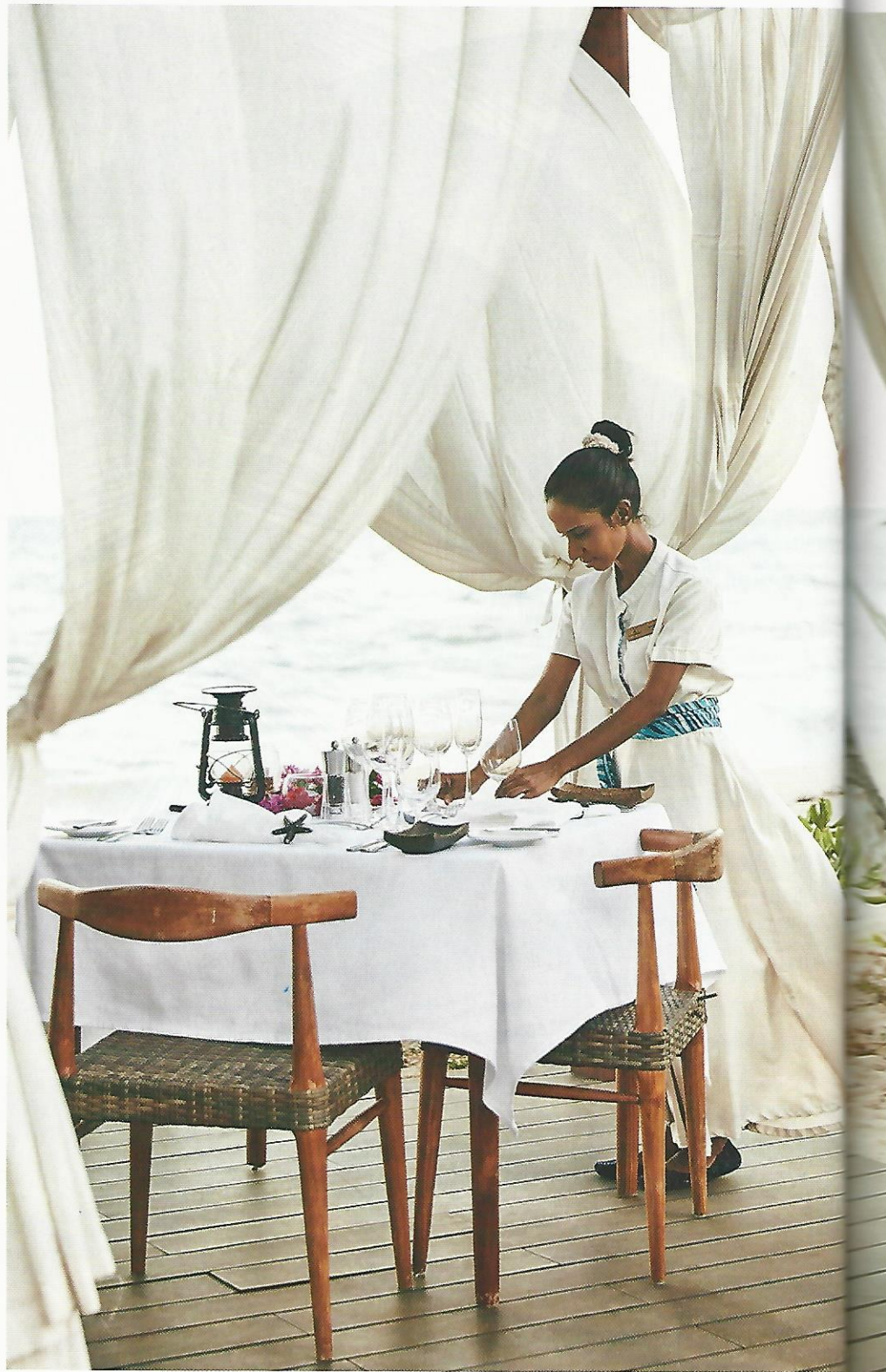
The table is set for Anantara’s private dining on the beach

In recent years, chic boutique properties have opened to complement the backpacker lodgings and beach cabins. Maya villa ( mayatangallesrilanka.com ) and Coco Tangalla