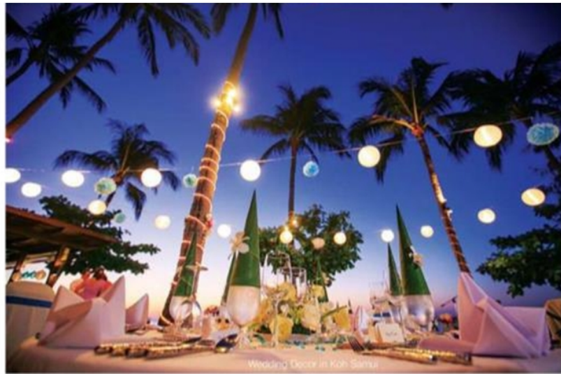
Wedding Dinner in Koh Samui

Wedding Venues: Dusit Thani Hotel, Anantara Hua Hin Resort, Centara Grand Beach Resort & Villas, Hotel V Villas Hua Hin MGallery by Sofitel, Cape Nidhra Hotel, Hua Hin.