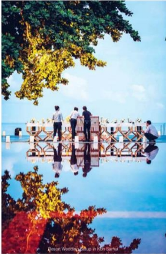
Resort Wedding Setup in Koh Samui