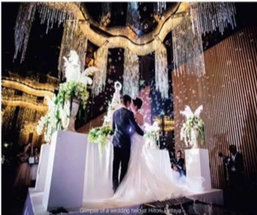
Glimpse of a wedding held at Hilton Pattaya