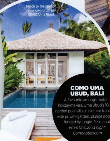
March to the beat of your own drum at COMO Uma Ubud