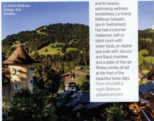
Le Grand Bellevue Gstaad. And breathe...

Known for both its pastoral prettiness and its beauty-optimising wellness sensibilities, Le Grand Bellevue Gstaad's spa in Switzerland has had a summer makeover, with a silent room with water beds, an Alpine spa suite with Jacuzzi and Rasul chamber, and a state-of-the-art fitness centre, all set at the foot of the beautiful Swiss Alps. From Dhs1,488 a night; Bellevue-gstaad.com