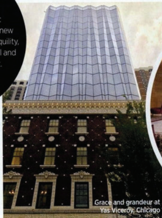
Grace and grandeur at Yas Viceroy, Chicago

The 2017 Chicago Architecture Biennial is one reason to visit the 'Windy City' this month, while the new Yas Viceroy is another. Sat in the heart of the Gold Coast, it marries modern and 1920s design, and iterates the art, lifestyle and design of one of America's most culture-conscious cities. From Dhs907 a night; Viceroyhotelsandresorts.com