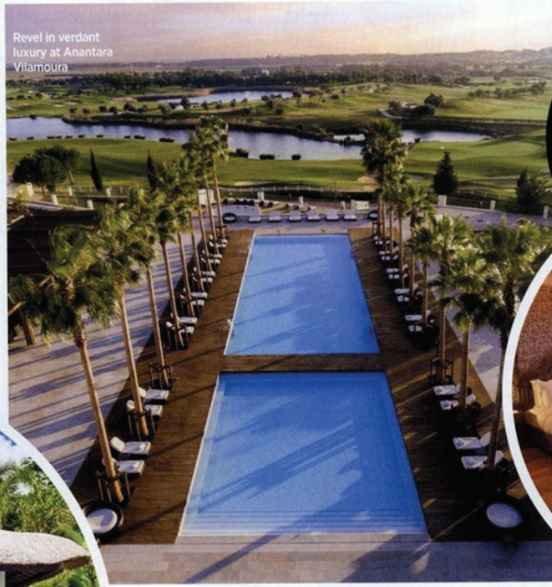
Revel in verdant luxury at Anantara Vilamoura

Bringing Anantara's luxury Asian aesthetic to Europe for the first time, Vilamoura in the Algarve oozes quiet prestige. Bucolic, surrounded by rolling golf greens and cerulean pools; cultural, with contemporary local artistry peppering the walls; and well-located, with the celebrity enclave of Vilamoura just minutes away, this is one of Portugal's most exclusive and desirable destinations. From Dhs1,483 a night; Vilamoura.anantara.com