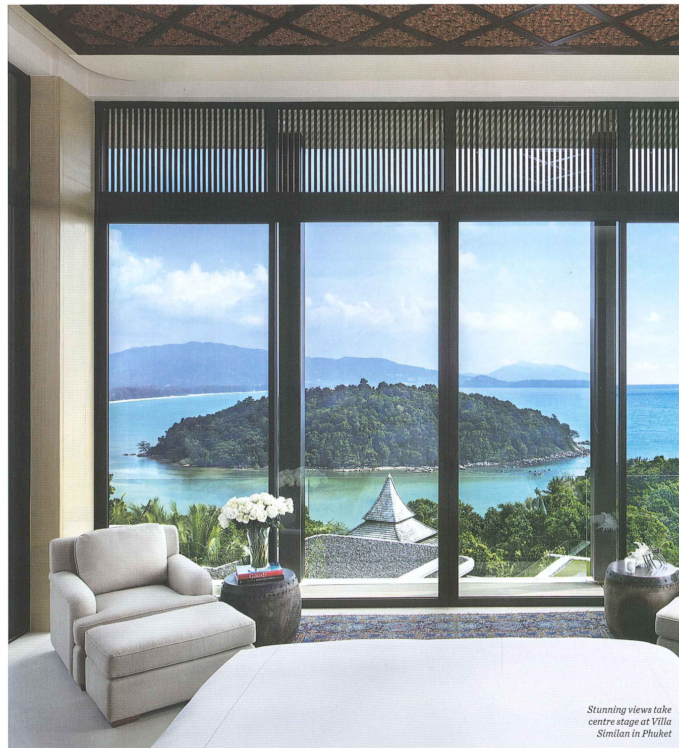
Stunning views take centre stage at Villa Similan in Phuket

Minimalist opulence in Thailand • Restaurants with style inspiration to take away • Amrish Patel's 'It List'