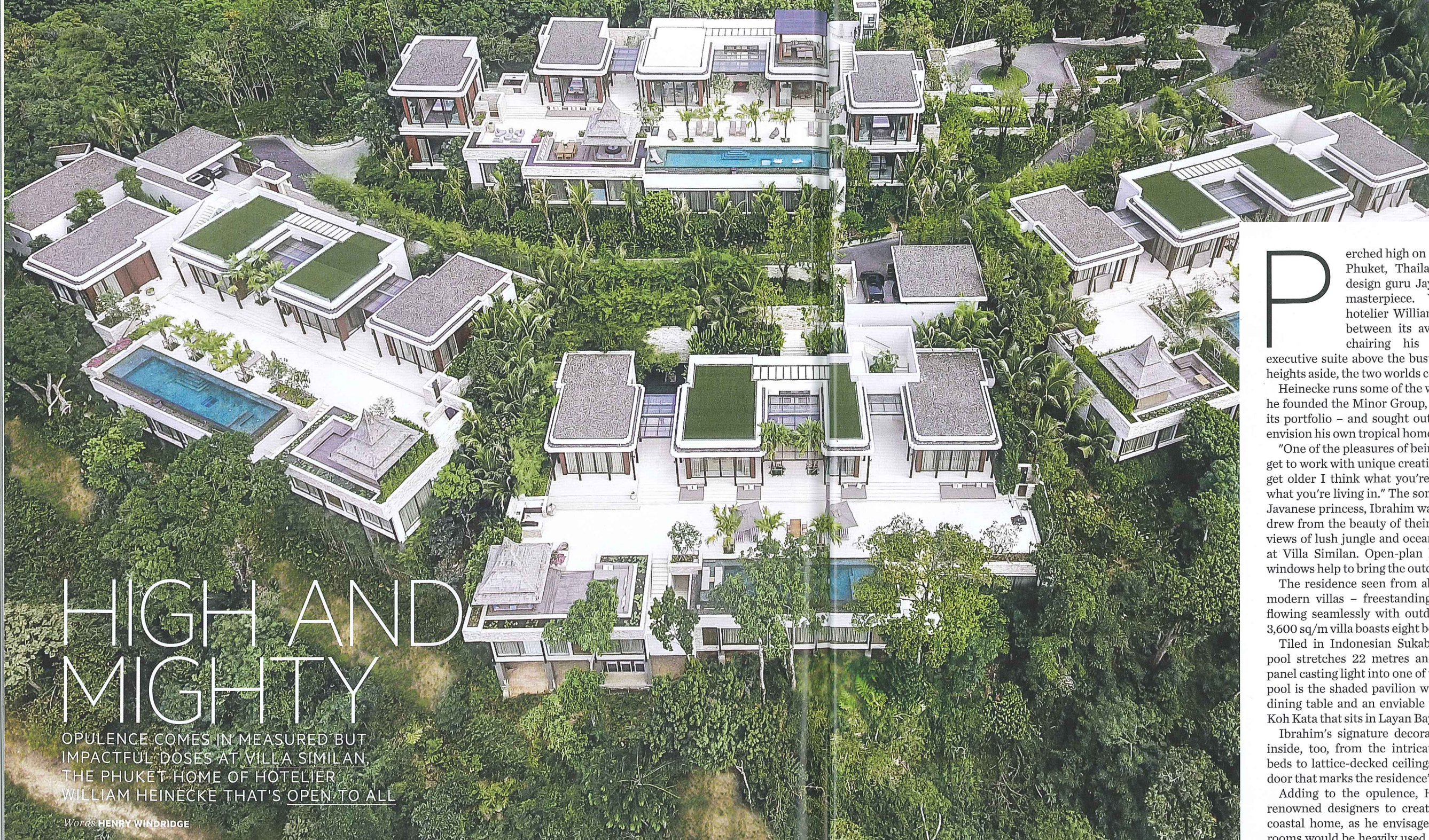
Villa Similan (pictured, top) is one of 15 luxury villas at Layan Residences