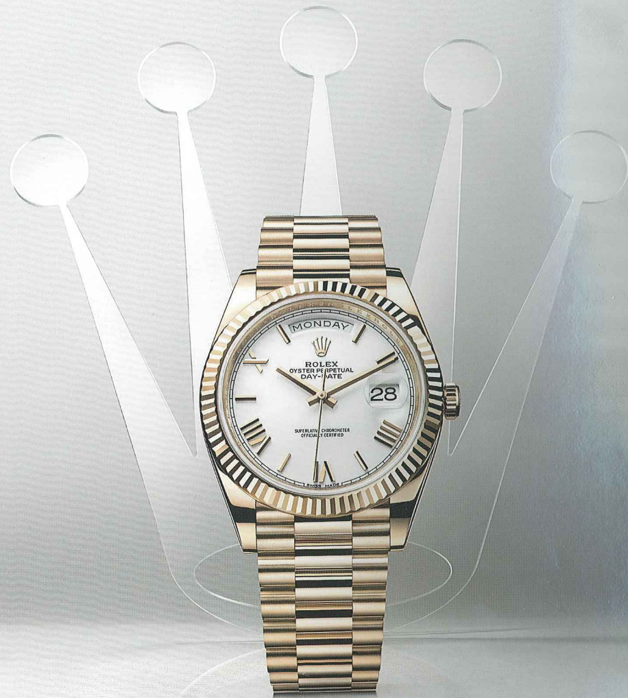
OYSTER PERPETUAL DAY-DATE 40

The international symbol of performance and success, reinterpreted with a modernised design and a new-generation mechanical movement. It doesn't just tell time. It tell history.