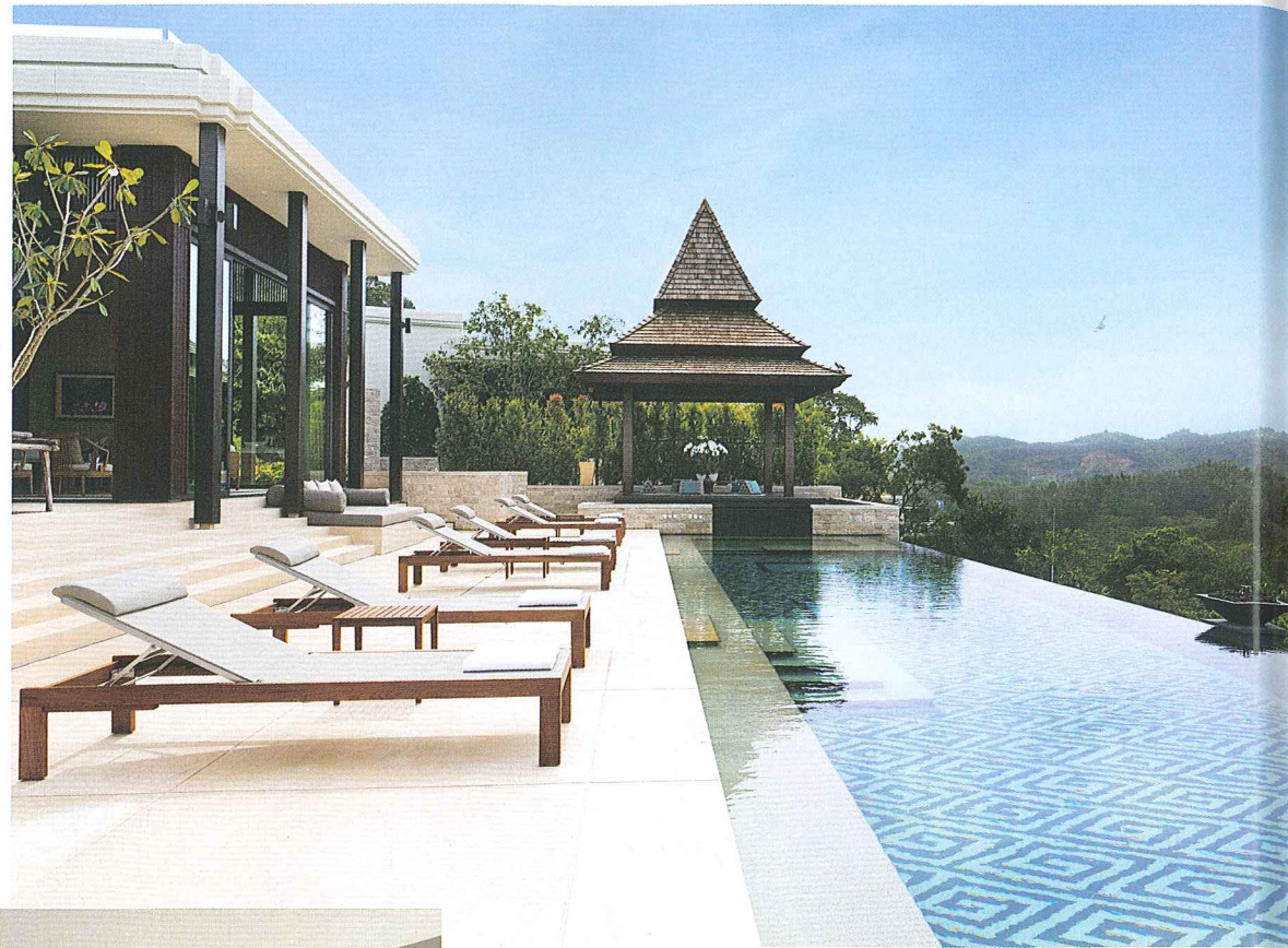
Right: The villa's 22-metre infinity pool is tiled in Indonesian Sukabumi stone. Below: Kathy Heinecke has added pieces from the couple's private collection throughout the property Opposite: Jaya Ibrahim's signature decorative touches include lattice-decked ceilings